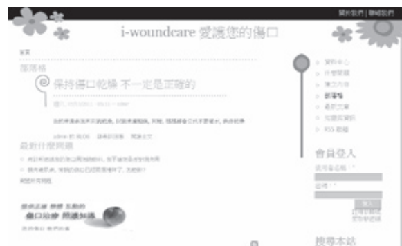
Fig 2. “Wound-care blog” for education and discussion with patient and their family. ( http://i-woundcare.com/blog )